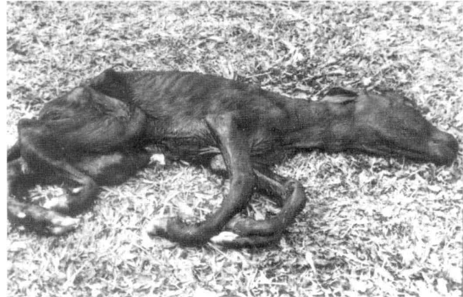
Fig. 1. A newborn buffalo calf with joint contractures in all limbs. The interphalangeal joints of the hindlimbs were fixed in flexed and extended position. Note the scant muscle development.

The arthrogryptic calves had varying expressions of the defect. Either the hindlimbs alone (bimelic) or all 4 limbs (tetramelic) were affected. There were no other associated congenital defects, except for brachygnathia in one calf. Two affected calves born alive were in sternal recumbency and unable to rise after birth. The remaining calves were born dead, one of them after a distocic delivery. Joint contractures were bilateral; but some differences were observed between limbs, and little passive mobility was possible in the flexed or extended joints (Fig. 1). The lesions were most frequently found in the metacarpophalangeal joints, the elbow, interphalangeal joints of the forelegs and in the metatarsophalangeal joint, followed by the stifle and hock joints of the hindlimbs. In all calves the interphalangeal joints were fixed in the flexed or extended position. One of them had lesions