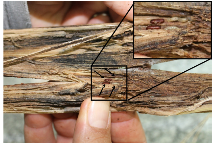
Fig.2. Sugarcane stems collected on the field, after three days under laboratory conditions, with larvae and developed pupae of Stomoxys calcitrans inside. Arrows indicate larvae and pupae positions; box with larvae and pupae in an amplified view.

did not mention the sugarcane stem as a possible larval habitat for S. calcitrans . After this information we started to look inside the sugarcane stems, and we found the larvae in three opportunities in different municipalities (Fig.1). It is important to notice that the stems were sliced and in decomposition after the sugarcane harvest. During the harvesting process some pieces of stems are left on field by the harvesting machine. Usually these stem pieces are 15-40cm long and are mixed with the straw scattered over the ground. The stem pieces were taken to the laboratory and larval development was observed until pupation (Fig.2). Eleven days after collection, the adults emerged and we could identify them as S. calcitrans .