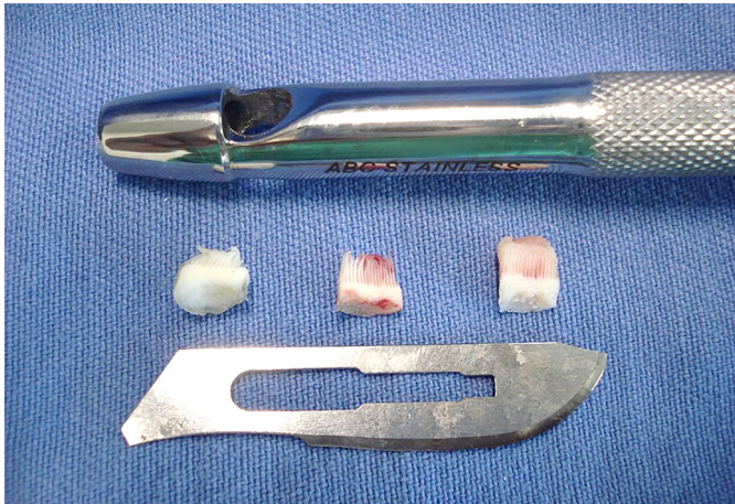
Fig.1. Hoof lamellar samples taken from biopsy procedure technique using a Keyes dermal punch.

Frozen samples were thawed in Petri dishes. The deep dermis was already lost during biopsy; the excess stratum corneum was removed with a scalpel. RNA was extracted, beginning by adding trizol (Invitrogen, Carlsbad, CA, USA) at 1mL/100 mg of tissue, followed by adding chloroform; the samples were then homogenized and vortexed. The samples were centrifuged at 12,000rpm, for 10 min at 4°C. Between samples, the homogenizer was rinsed using 50 mL Falcon tubes containing distilled water, followed by 70% isopropanol, then distilled water again.