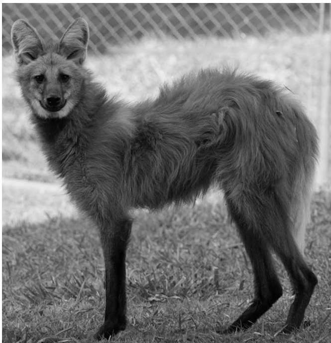
Fig.1. A male adult maned wolf from Companhia Brasileira de Metalurgia e Mineração's (CBMM) Wild Fauna Conservation Breeding Center located in Araxá, Minas Gerais, Brazil.

Given that the literature contains sparse reference to ocular parameters in maned wolf, the objective of this study was to establish the lacrimal quantity and intraocular pressure of captive animals from the Companhia Brasileira de Metalurgia e Mineração's (CBMM) conservation breeding center located in Araxá, Minas Gerais, Brazil, at an altitude of 1,095m.