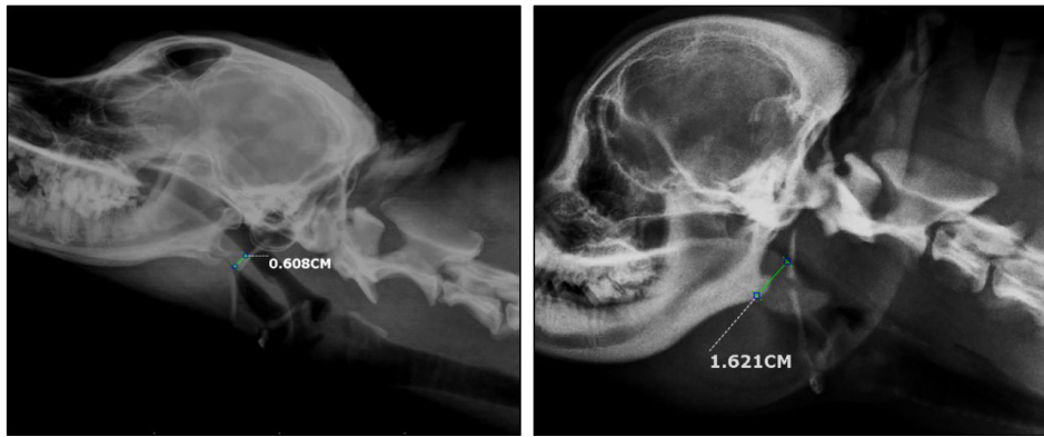
Fig.2. Radiographic image of cervical region in right laterolateral projection. On the left, a soft palate (marked green) is observed in a Beagle (CG), compared to the right image, in which the soft palate, in a French Bulldog (BG), is visibly thicker (bordered in green).