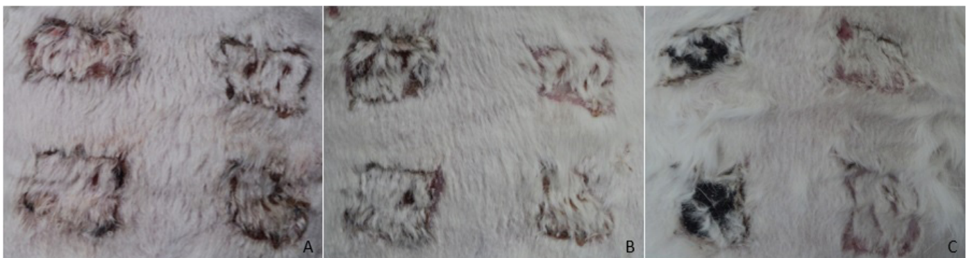
Fig.2. Macroscopic evaluation of the skin grafts performed in Rabbit 7. The autologous and homologous grafts are positioned, respectively, at the right and left side. The cranial defects were treated with PRP in liquid form. (A) Five days postoperatively, the prevalence of rosy color in the grafts. (B) 12 days postoperatively. Note the largest areas of necrosis of the homologous grafts. (C) 19 days postoperatively. Note the good cosmetic appearance of the autologous grafts.

Opposite to macrophages count, the average number of fibroblasts was larger in autologous skin grafts of the G1 and G2 ( p = 0.04 ) at the different moments of evaluation