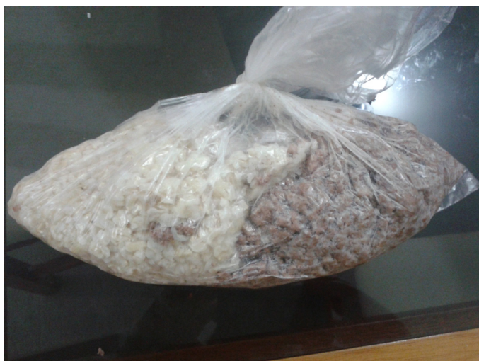
Fig.1. Homemade food prepared with brown rice and lamb protein, fractionated in 1:1 for a dog of 22lbs (10kg) and packed in plastic bag for later freezing and distribution.

Each animal was subjected to dermatological clinical examination, and lesional score established by CADLI index on days 0, 15, 30, 45 and 60, during the feeding with hydrolyzed soy dog food and