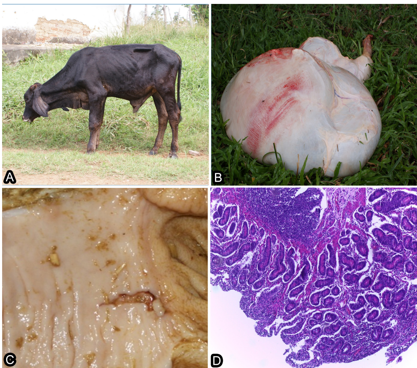
Fig.3. (A) Experimentally poisoned cattle presenting apathy and orthopneic posture due to digestive system lesions. (B) Multifocal areas of hemorrhage are observed in the rumen serosa. (C) Duodenum mucosae presenting erosive lesions. (D) Epithelial necrosis, severe neutrophilic and lymphocytic inflammatory infiltrate of the duodenal mucosae. HE, obj.10x.

Poisoning clinical signs varied in severity degree yet all animals presented apathy, anorexia, restlessness, irritability, ocular discharges, sialorrhea, dehydration, polyuria and diarrhea. In addition to these clinical signs, individuals that consumed 60g/kg of Merremia macrocalyx leaves presented ruminal motility reduction, mild to moderate tympanism, and fully recovered within 7-8 days. Those in the 80g/kg daily dose presented ruminal motility reduction followed by atony, tympanism, dyspnea, orthopneic posture, muscle tremors, weakness, sternal recumbency and death within 2 or 3 days (Fig.3A). There was a decrease in methylene blue reduction activity and ruminal fluid pH was alkaline in all cattle, reaching values between 7.5-8.0. Density and motility of protozoa declined progressively only in the most severe cases of intoxication; the percentage of mortality ranged from 60% to 80%. No significant changes were observed